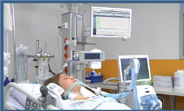
CritIS as a bed-side point of care.

Advantages for managing patient information throughout the healthcare environment: